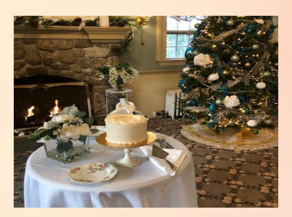
*additional seating options available